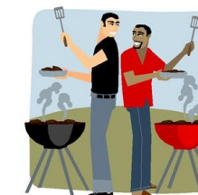
Green House Cookout

Crossroads Group is having a movie night each month!! Please contact Intergroup for further information