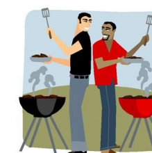
Green House Cookout

Crossroads Group is having a movie night each month!! Please contact Intergroup for further information