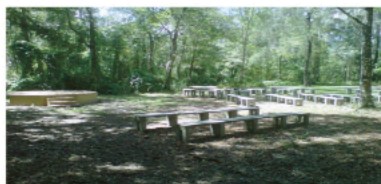
Sunday AM Meeting Place