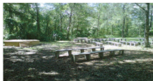
Sunday AM Meeting Place