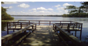
Boardwalk on Lake Mills

There are playgrounds, volleyball, horseshoes and other games. We have reserved all the campsites for Saturday night, with room for 90 campers! Facilities are available next to the campsites.